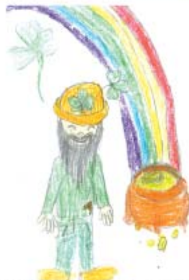
Drawing by Nicole Vreeman